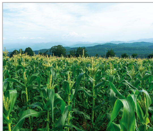
The AGREUS system is used both in field monitoring of crop conditions, as well as conditions in greenhouse and under covers