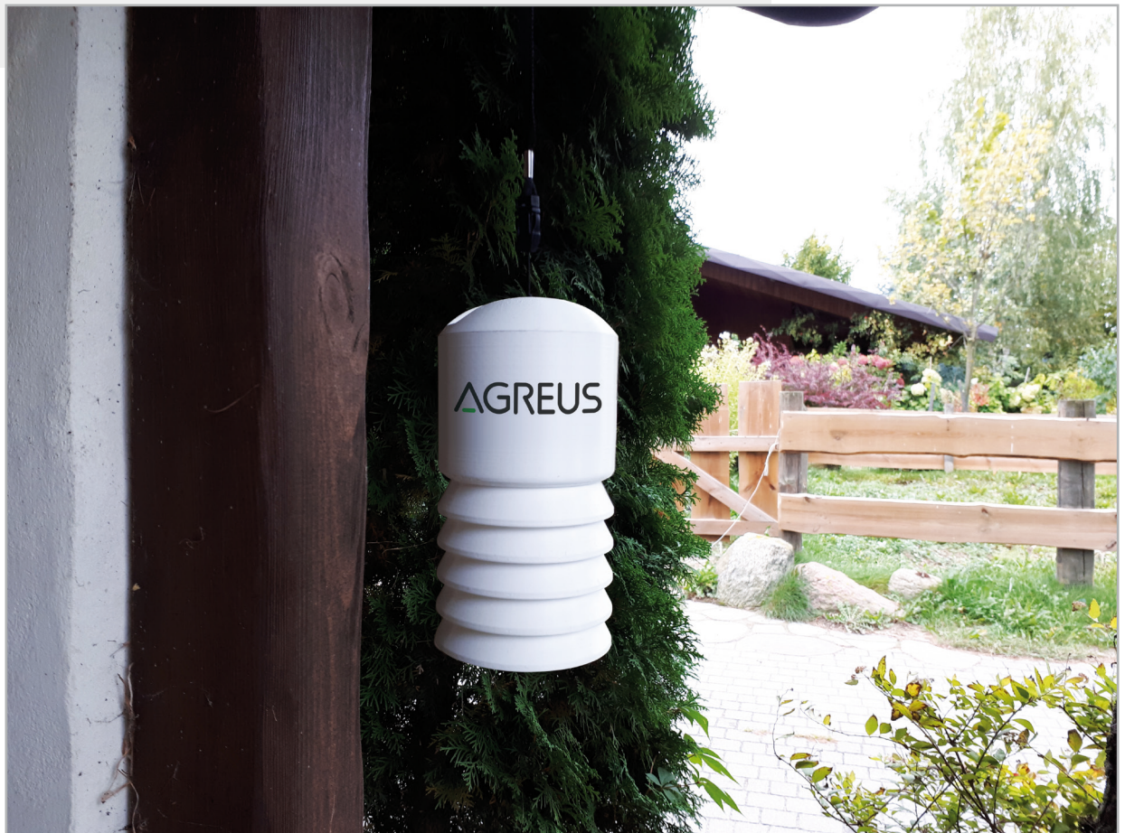
The pictures show the components of the AGREUS system. Above the soil probe is shown, i.e. humidity, temperature and salinity sensor. Field temperature and humidity sensor is shown below.

AGREUS includes many types of environmental and technical sensors that send data to the integrating portal which process them into decision-support information. The monitored temperature and humidity of the air and soil are the basic parameters necessary to determine the water needs of plants in the irrigation process. In addition, data on rainfall, wind speed, and insolation are monitored or collected from third sources, which allows increasing the precision of agrotechnical activities. In addition to environmental measurements, the system has a wide range of remote control options for various types of devices. By assumption, the system should solve many disadvantages of current control systems, e.g. in irrigation, such as the need to run valve control cables and poor opportunities to create irrigation schemes.