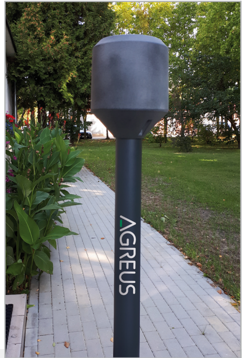
The photo above shows the base station responsible for communication between system elements located in the field and computing cloud. The valve control module and the control panel of the valve station are presented below.

The heart of the AGREUS System is the base station transmitting data from/to dispersed terminals, i.e. creating a network of sensors and measuring and executive modules. The transmission takes place using a long-range wireless radio network - LoRa . This technology, depending on the terrain conditions, allows covering with its operation a large area of crops with low energy consumption, which is a critical parameter for battery-powered devices. In addition, the AGREUS base station can connect to the Internet using the Wi-Fi of the existing local network, independently via GSM (3G, LTE) or, optionally, via Ethernet cable. The Internet connection allows you to send the collected data to the AGREUS Portal running in the cloud. Transmitted data is collected on individual accounts of the System users, becoming the basis for ongoing analyzes and generated reports.